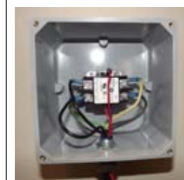
24 volt contactor enclosure